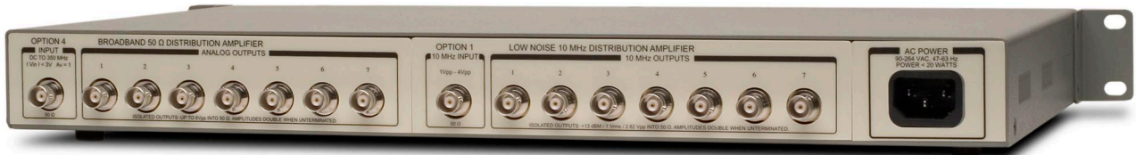
FS735/1/4 Rear Panel with one Broadband 50Ω distribution amplifier and one 10 MHz distribution amplifier side by side.