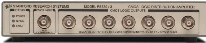
FS730/3 Front Panel

FS730 and FS735 series — CMOS Logic Distribution Amplifier